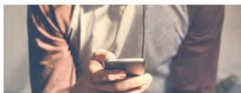
Andrew Tate and Toxic Influencers