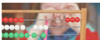
Myths and Truths about Dyscalculia

For children with special educational needs , we have created All About Me: My Learning Profile which provides a template to encourage them to identify their strengths, sticking points and the things that help them to learn more effectively. This activity can be completed in school or at home and then be shared with teachers so that they can offer optimal support to the individual.