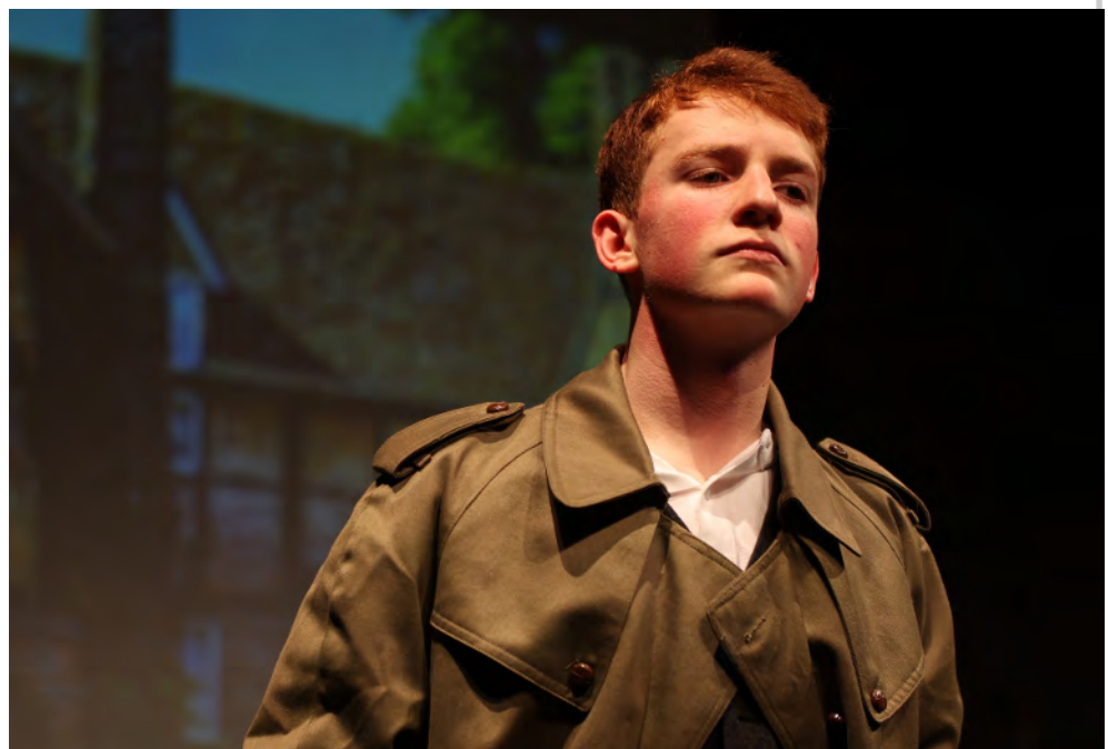
Our Fourth Year pupils delivered an exceptional performance of Goodnight Mister Tom !