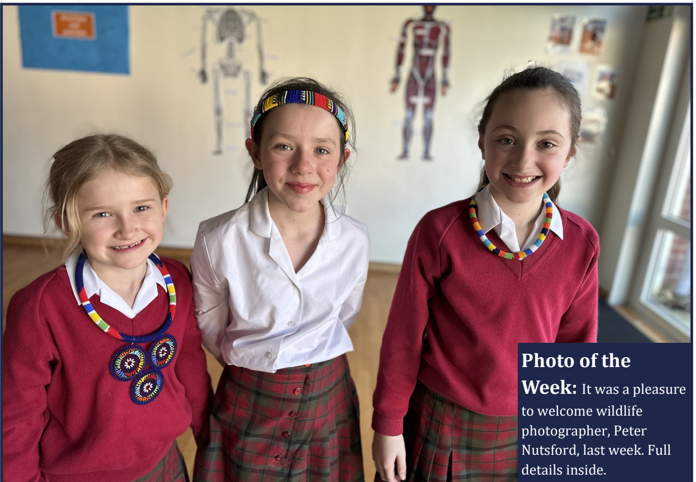
Photo of the