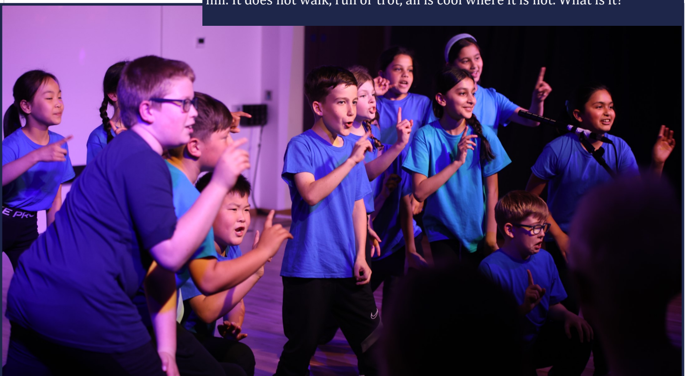
Photo of the Week: Year 5 performed a series of highlights from musicals for the Drama Week performance. Thoughts and reflections inside.

Head's Challenge: Never resting, never still. Moving silently from hill to hill. It does not walk, run or trot, all is cool where it is not. What is it?