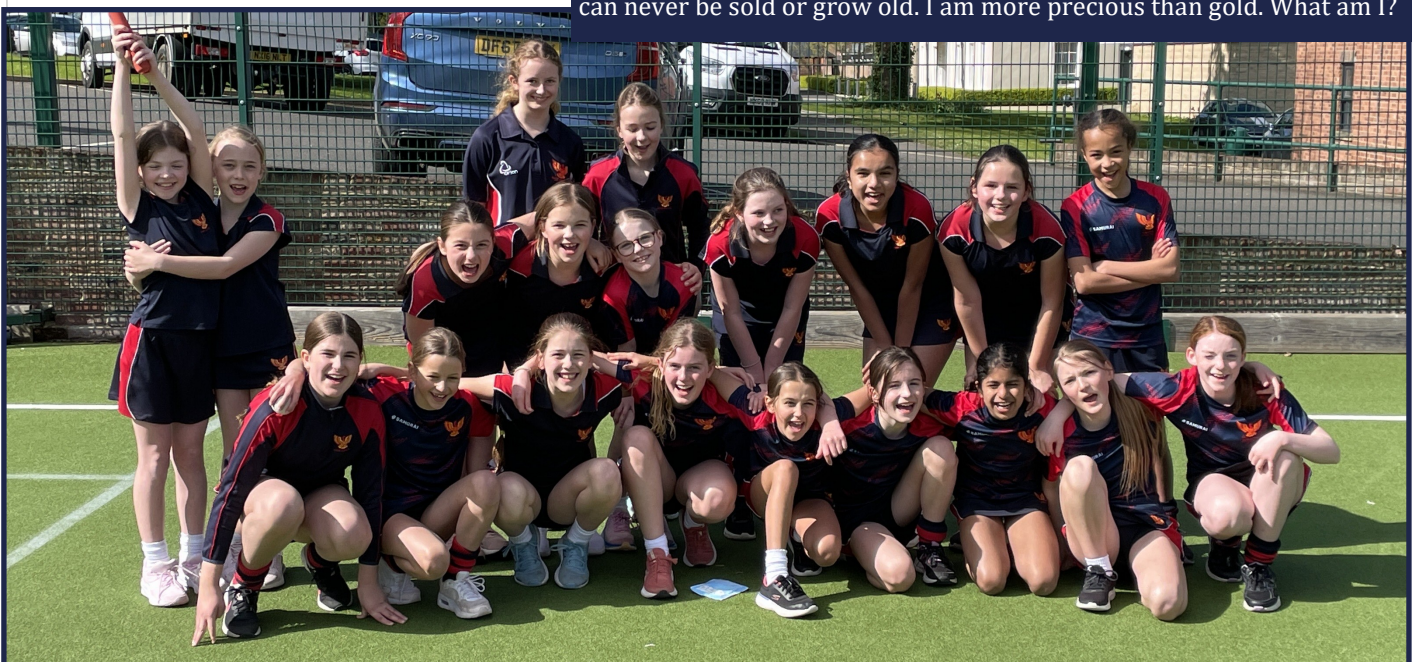
Photo of the Week: The cricket season is underway for boys and girls, with the U10/11 girls enjoying their first fixture of the season last Friday.

Head's Challenge: I am as bright as sunshine on a warm day, I can never be sold or grow old. I am more precious than gold. What am I?