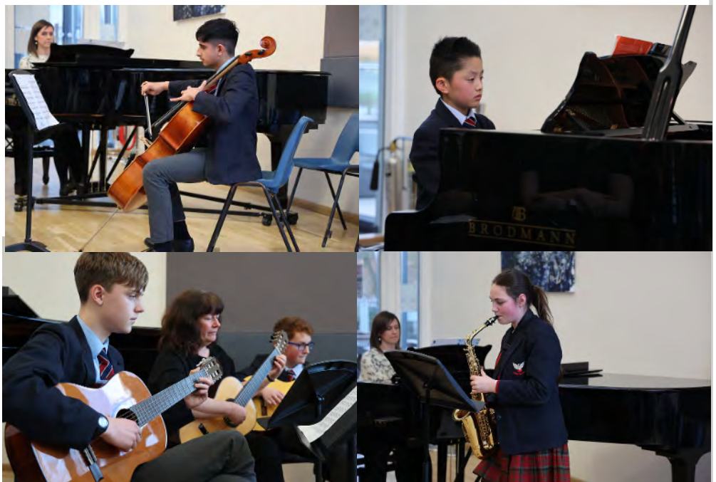
Some of the fabulous musicians at the first Concert and Cake this week: the next Concert and Cake is March 13th at 5pm