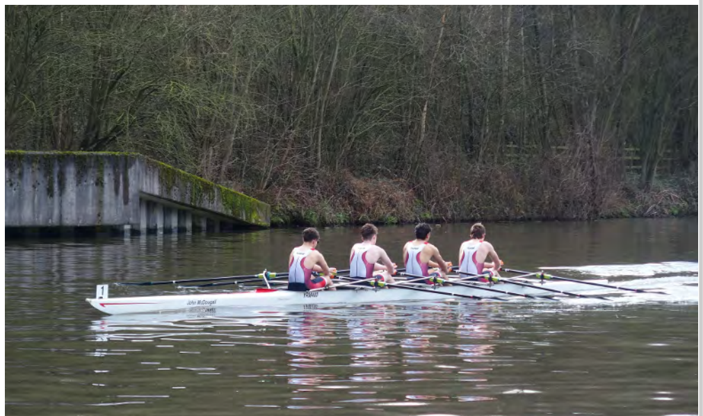
Rowers at the Leeds Junior InterRegional Trials - Full Report Next Week