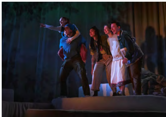
The Company of A Song for Ella Grey, photo by Topher McGrillis