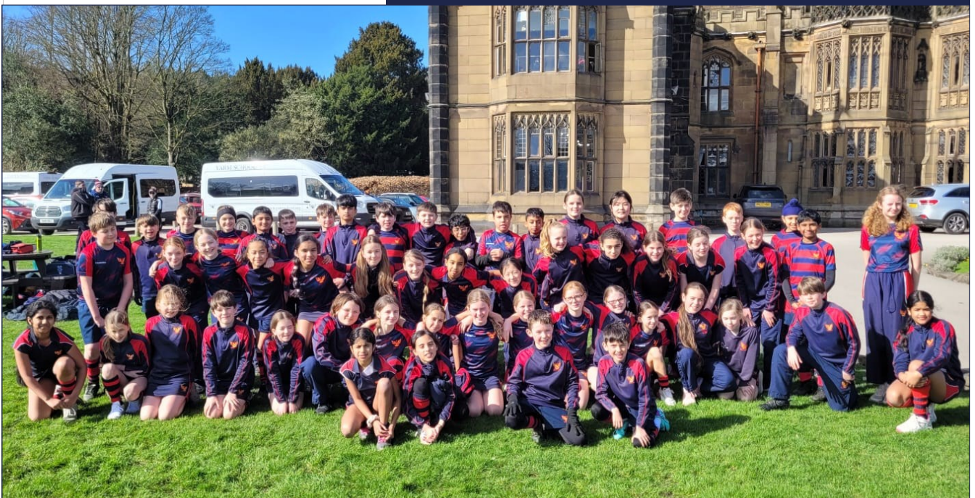
Photo of the Week: Find out about our Year 6 sports tour to the north-west of England on page 2 of the Flier this week.

Head's Challenge: What is easy to lift but hard to throw?