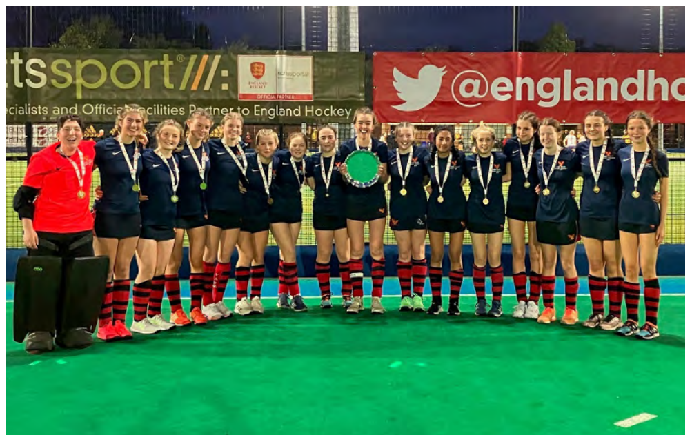
The victorious U16 team with their medals and trophy!