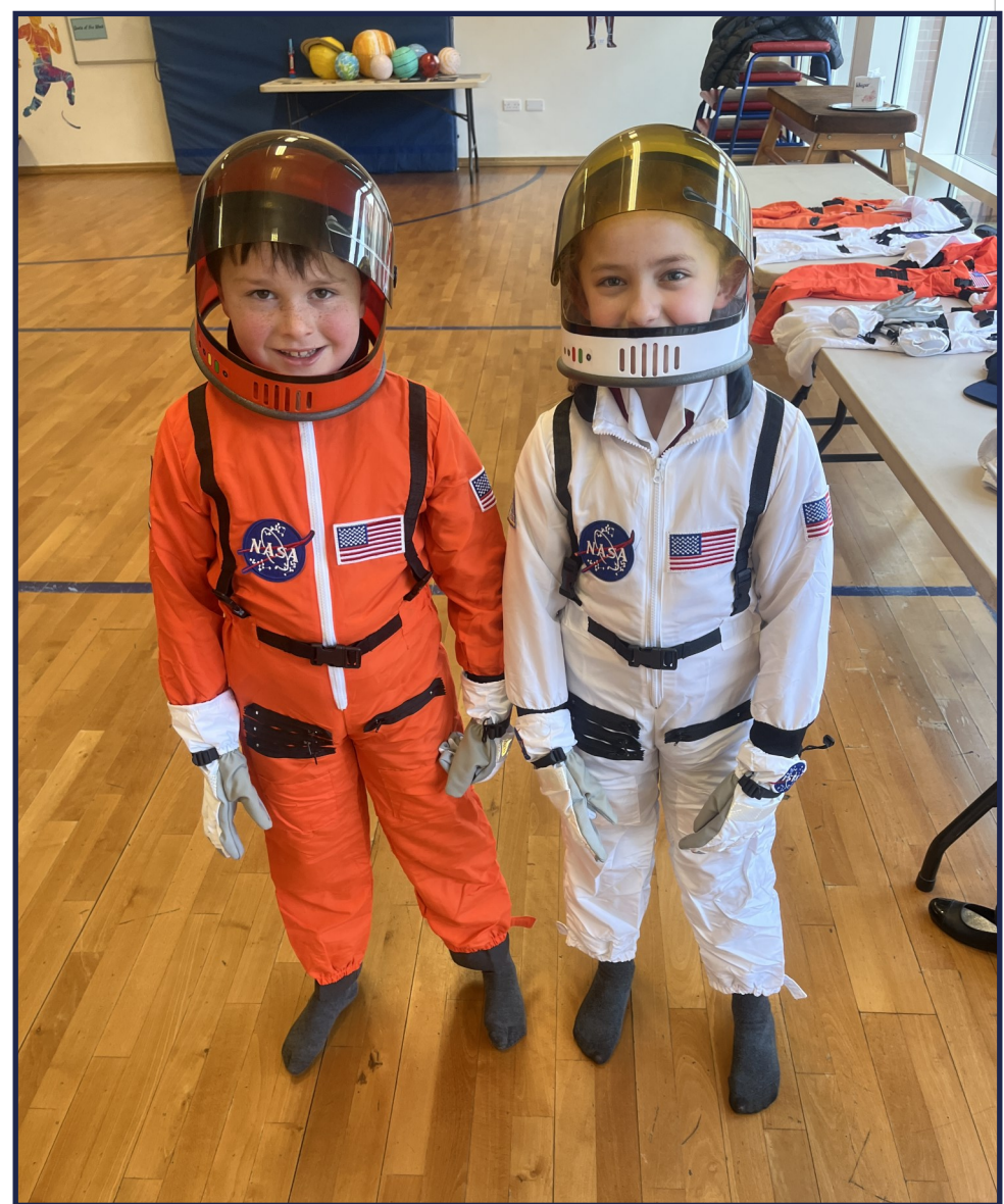
Photo of the Week: It has been STEAM Week this week, with the children finding out and exploring space!

Head's Challenge: I fill a room, but I take up no space. What am I?