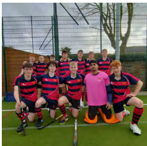
1st XI vs RGS