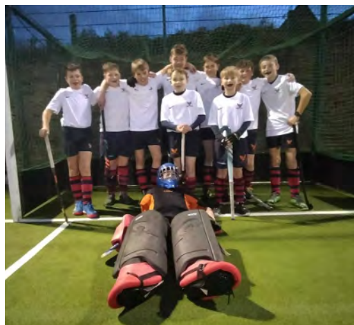
U13 vs Sedbergh