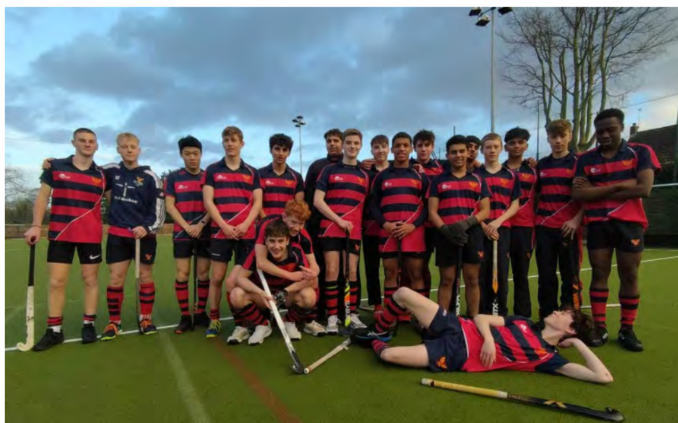
1st XI vs Barnard Castle