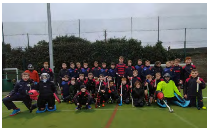
First and Second Years