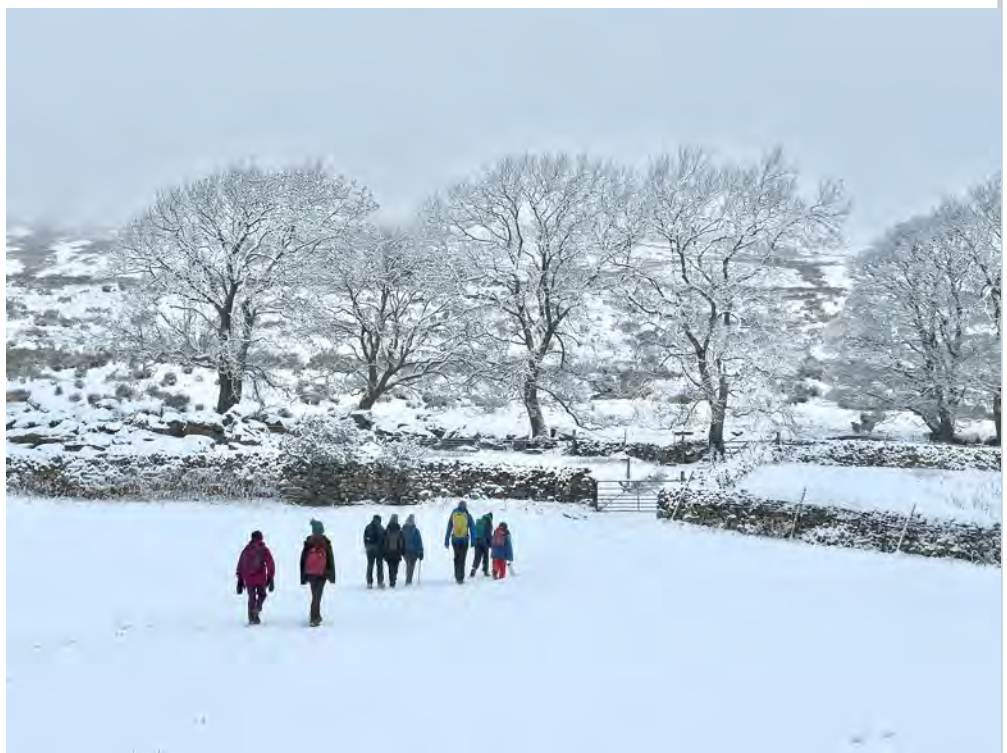
A winter wonderland in the Yorkshire Dales last weekend