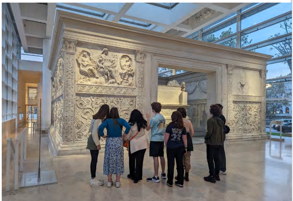
Students in awe of the Ara Pacis Augustae on the recent Classics trip to Rome