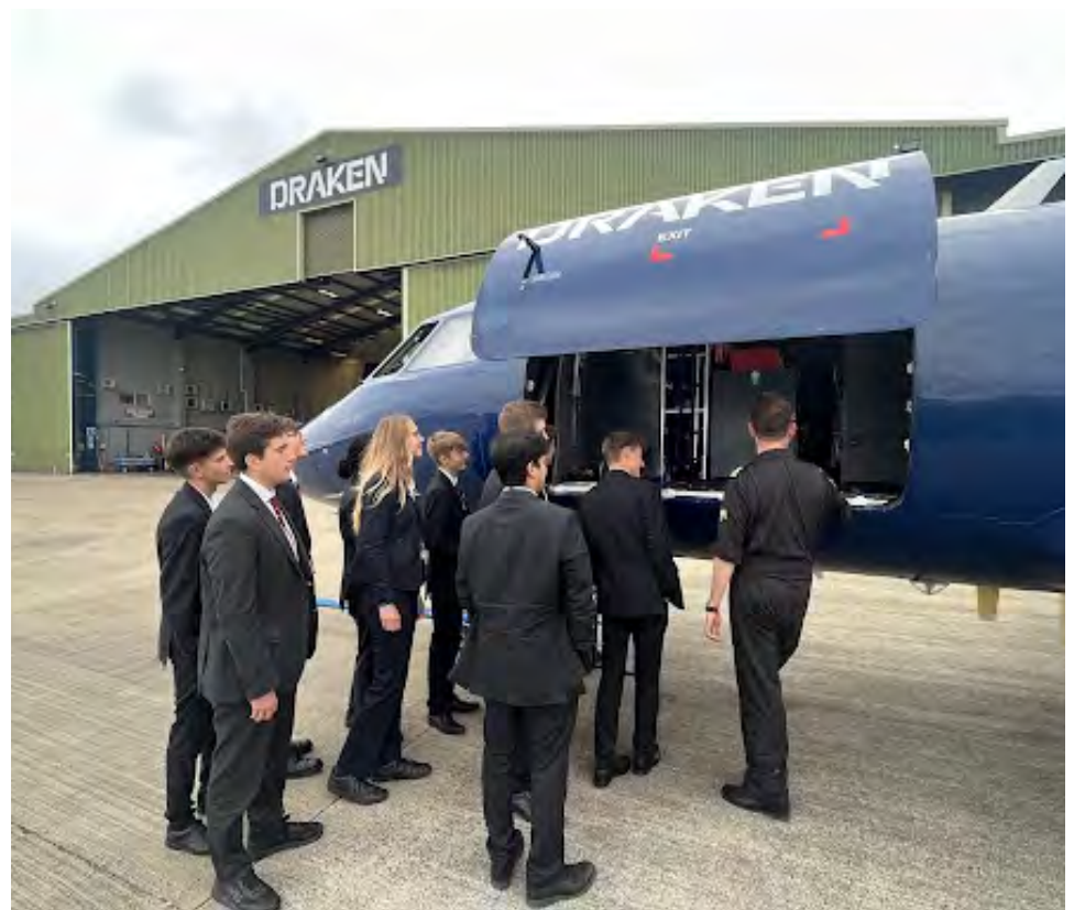
Upper Sixth students visit the Draken facility at Teesside Airport