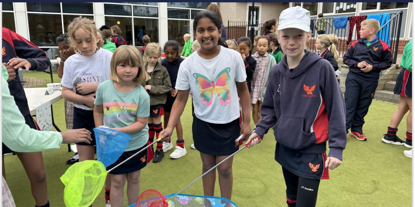
Photo of the Week: A fantastic effort this week by Arkwright, who raised an incredible £692 for the Tees River Trust with their house charity day.

Head's Challenge: What four-letter word can be written forwards or backwards and can still be read from left to right?