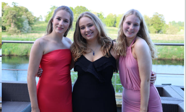
Upper Sixth Leavers' Dinner