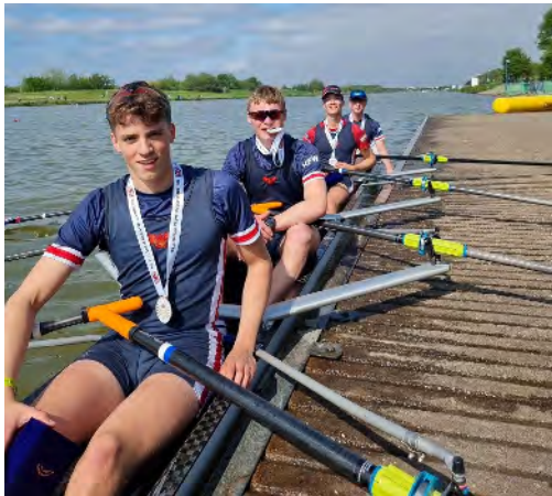
Success at Nottingham City Regatta

I have been reminded in many different ways why Yarm School is a wonderful place to work this week having been involved in, or aware of a contrasting combination of events which - individually and collectively - have made me proud of our pupils, colleagues and community.