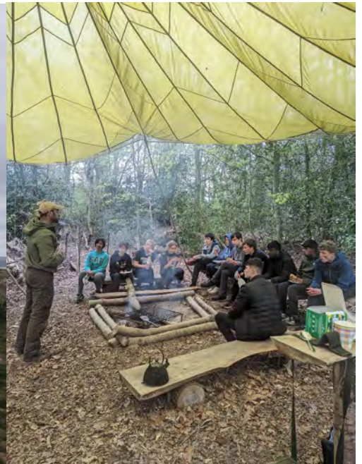
CCF enjoy adventuring in Northumberland.