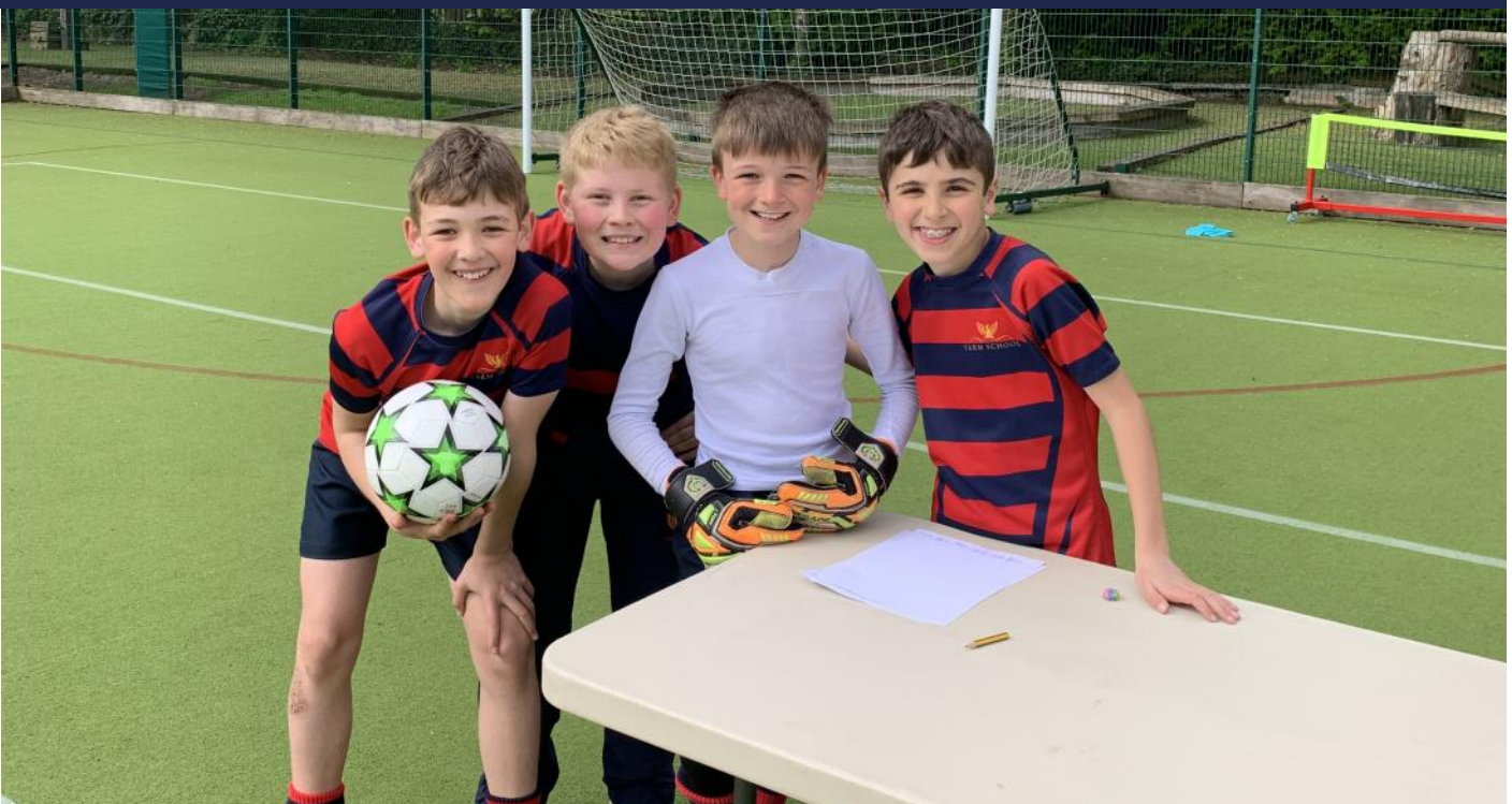
Photo of the Week: It was the turn of Brunel this week to run their Charity Day, in aid of the Great North Air Ambulance Service.