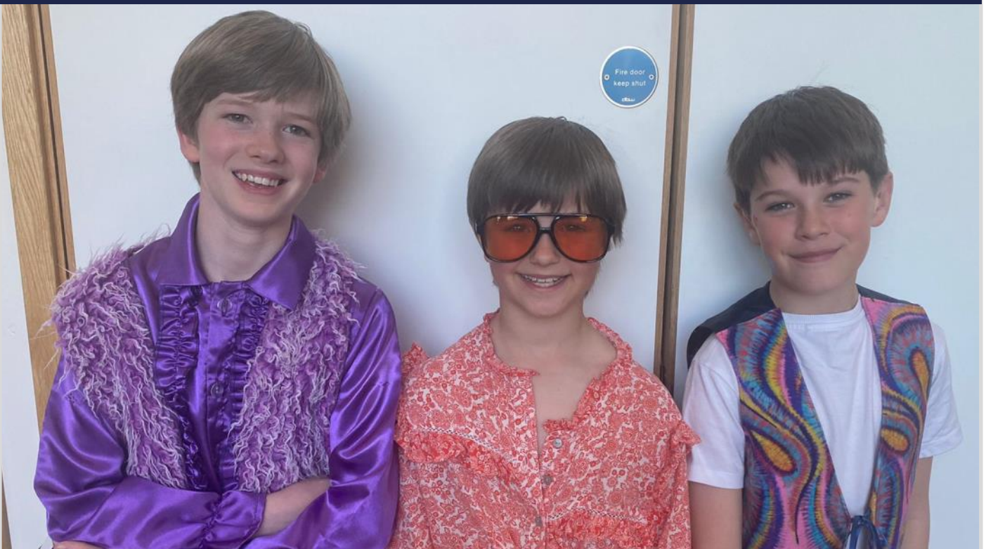
Photo of the Week: The Senior School Fashion Show saw a number of our dancers take to the stage in 70's style last week. Report and pictures inside.