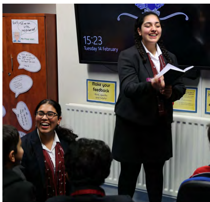
Yarm Apprentice students visit Prep, where their final challenge is set!