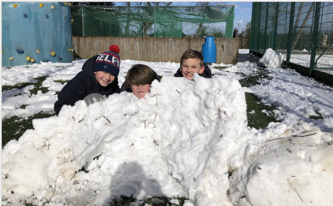
Photo of the Week: An unexpected turn in the weather led to an impromptu snowman building competition last Friday! More pictures inside.

Head's Challenge: What kind of coat is always wet when you put it on?