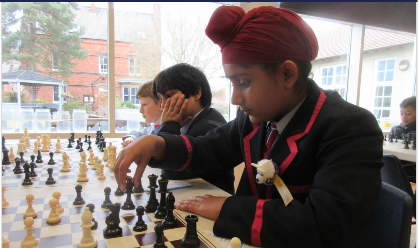
Photo of the Week: The school round of the UK Chess Challenge took place last weekend. Report inside.