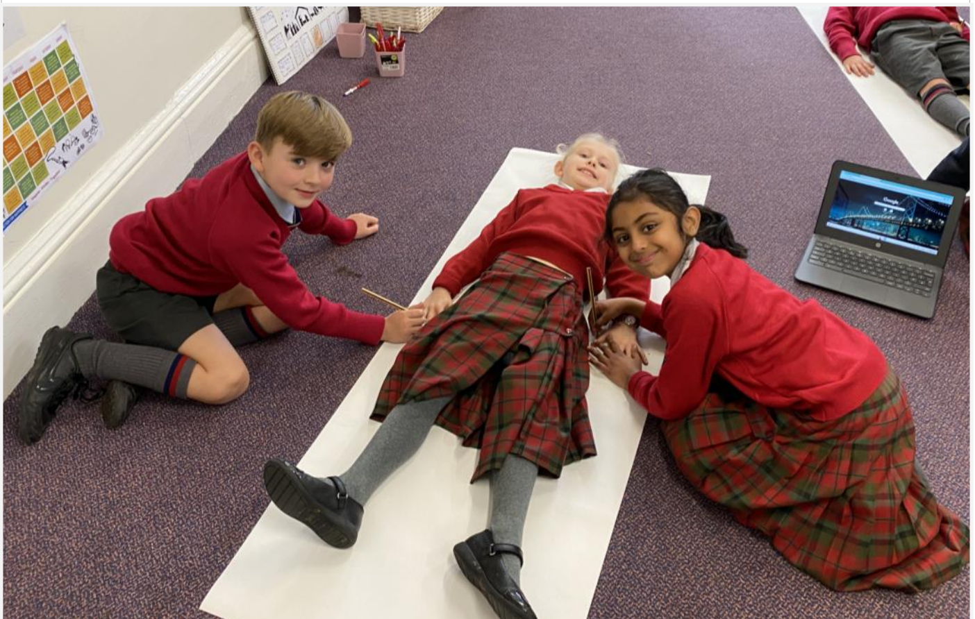
Photo of the Week: Year 3 have been finding out the names of body parts this week in French!

Head's Challenge: Marie is numbering her notebook by hand. The book has 100 pages, so she numbers them from 1 to 100. How many times will she write the figure 8?