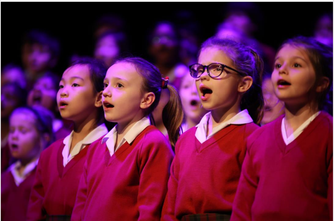
Photo of the Week: Pictures from our Christmas events, including our Festival of Carols and the Year 3 Nativity can be found inside this edition.

Head's Challenge: Add me to myself and multiply by 4. Divide me by 8 and you will have me once more. What number am I?