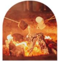
Books to Help Teach Young Children about Fire Safety