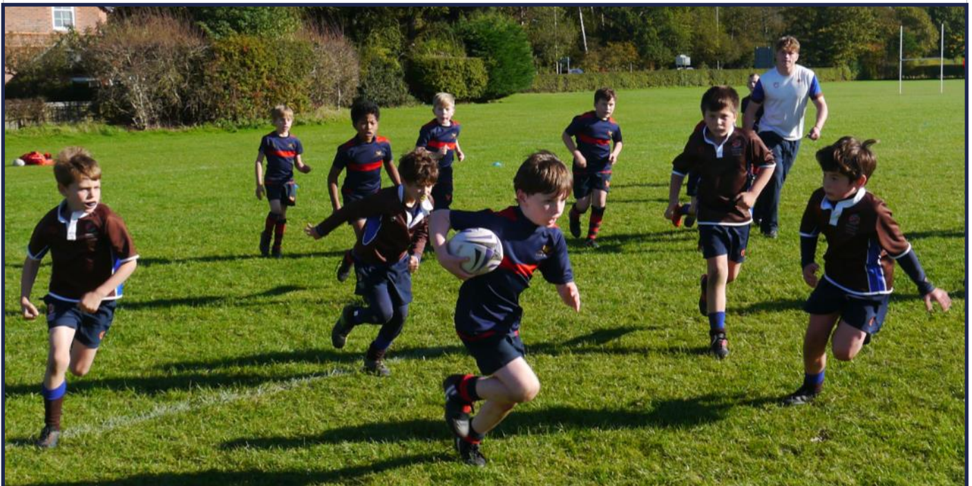
Photo of the Week: Our Under 9 rugby and netball festivals took place prior to half-term, with the sporting action already back underway since we have been back.

Head's Challenge: You can always find me in the past. I can be created in the present but the future will never taint me. What am I?