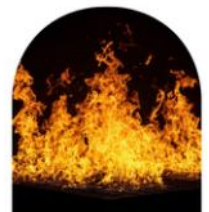
Science of Fire Quiz