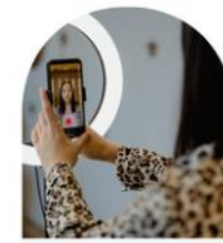
Taking a Closer Look at TikTok

A quick reminder As a parent at a Tooled Up school, you have full unlimited access to the Tooled Up library. If you have not created your account yet, click here to register for an account . It takes less than 2 minutes to enter your details and unique school if you need assistance, we are always happy to help at support@tooledupeducation.com . If you already have an account and you have forgotten your password, then simply click on any of the resource links above, click "Lost your password" and follow the instructions.