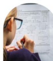
Myths and Truths about Dyscalculia