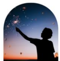
Children's Relationship with Fire: Five Things Every Parent and Professional Should Know