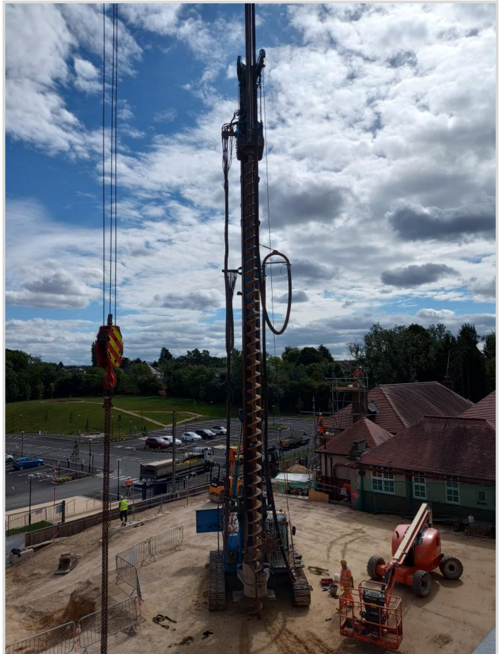
Photo of the Week: The building works are starting to pick up speed on the Prep site, as highlighted by Mr Evans' image.

Head's Challenge: How many squares are on a chessboard?