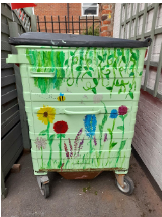
The Community Action Group

In the autumn, we hope to complete a mural inside the centre; it would be wonderful if some more of our budding artists could be involved!