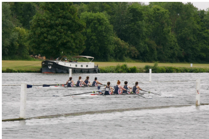
On the second day of racing, the winning crew were drawn against Kingston Grammar School.