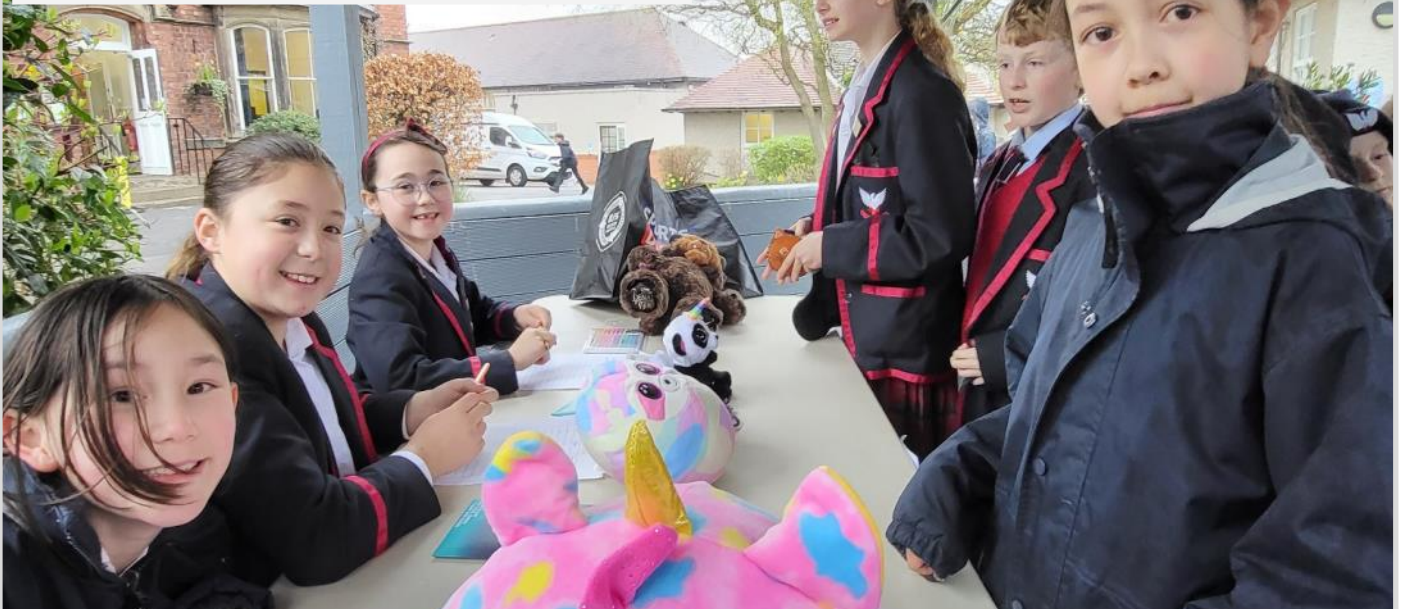
Photo of the Week: Well done to the Year 5 children who ran their own Charity Morning on Monday, in aid of the DEC Ukraine Humanitarian appeal. An incredible £391.62 was raised!

Head's Challenge: I have six eggs. I broke two, cooked two, and I ate two. How many eggs are left?